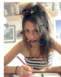
watercolor Lorraine Remise Flux créatifs (2021)